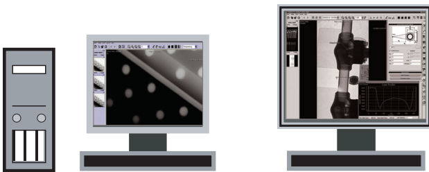
Color and monochrome/high resolution