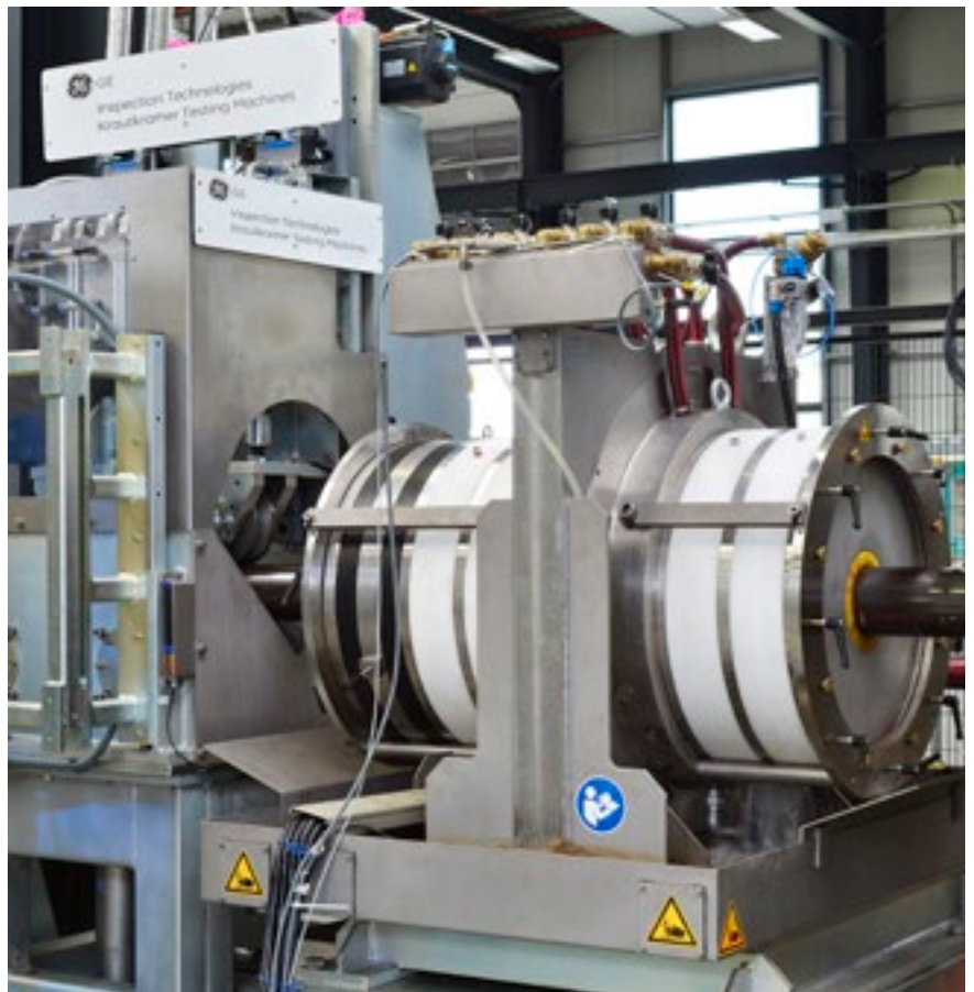
Krautkramer ROWA-WT test mechanics

The tubes are fed into the test chamber one by one on linear tracks by means of a guiding and transport device. A lifting/shifting table is required for installation of the test mechanism within the guiding and transport line.